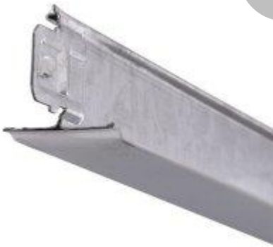
KD Travesaño secundario T 15/16" 0,61