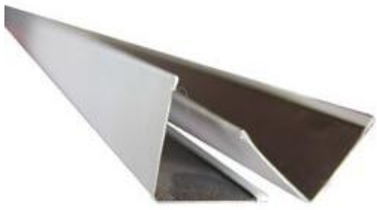
KD Perimetral L 19 mm x 22 mm