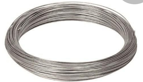
Alambre nº 12