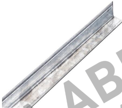
KD Perimetral L 19 mm x 22 mm PANEL REY