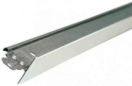
KD Travesaño principal T 15/16"