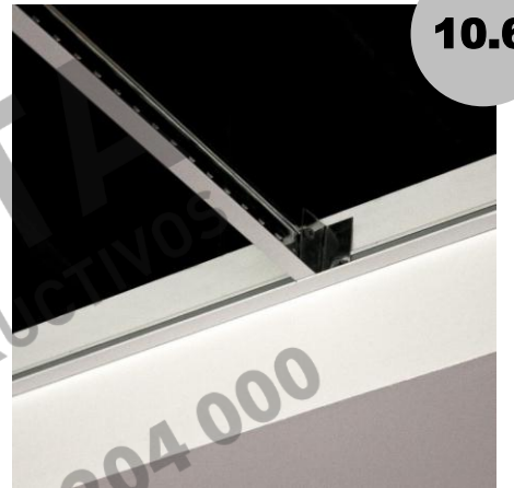
KD Travesaño principal T 15/16" PANEL REY